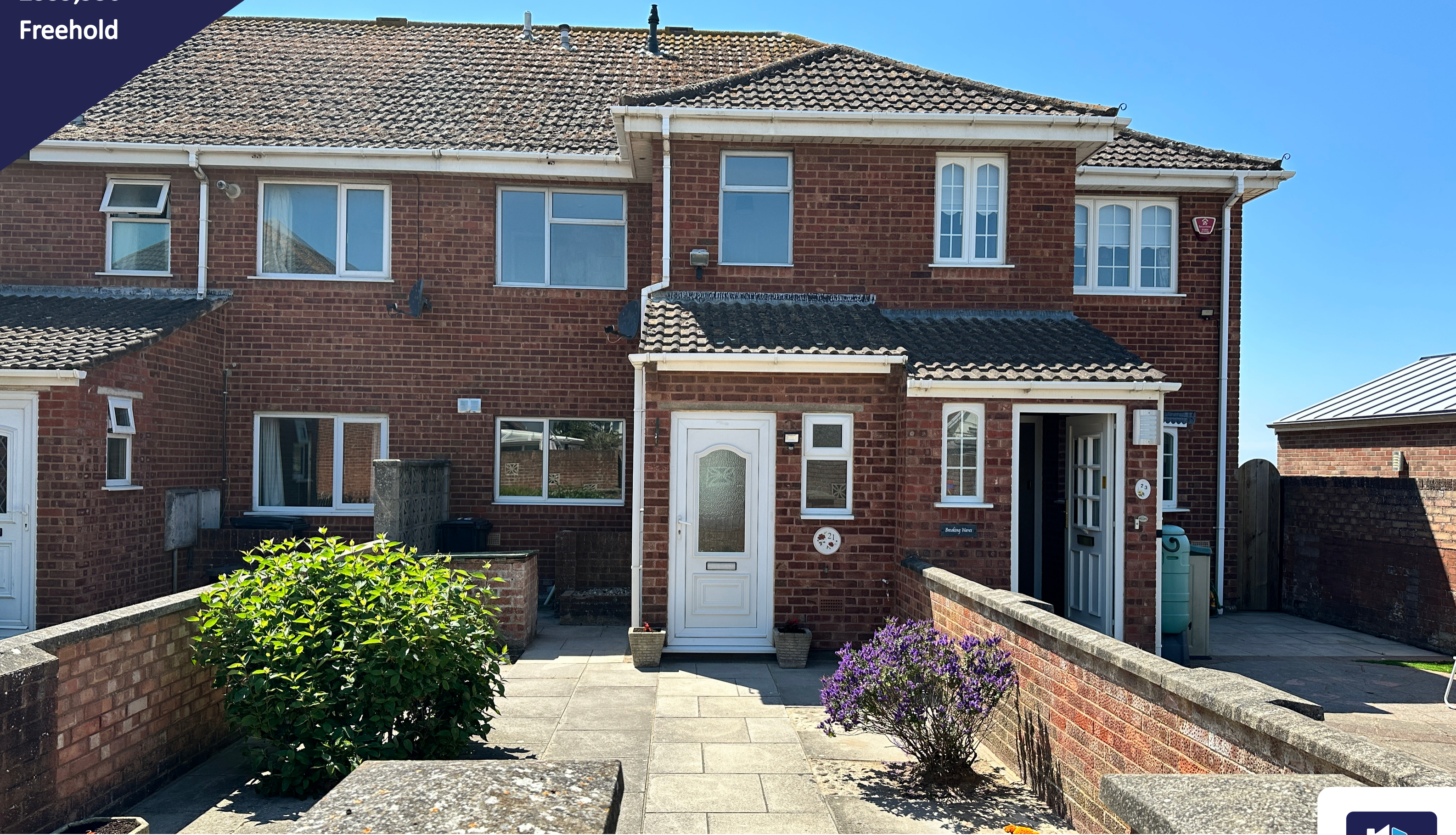
Poplar Road, Burnham-on-Sea, Somerset TA8 2HD 3 Bedroom Terraced House