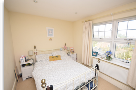
5 Thistledown Close, Wrecclesham, FARNHAM, Surrey. GU10 4AG. £1,395 pcm