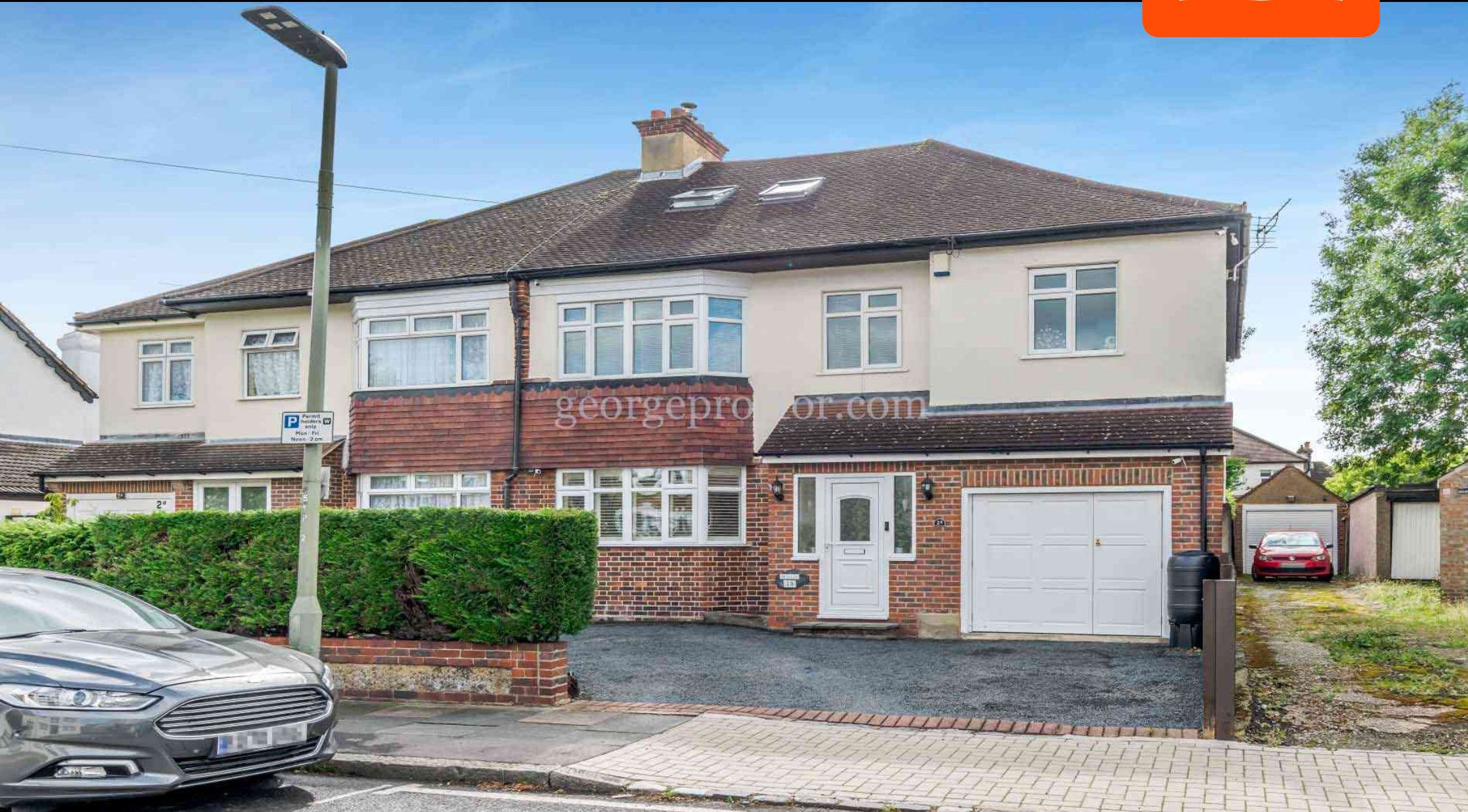
Pope Road, Bromley, Kent. BR2 9QB