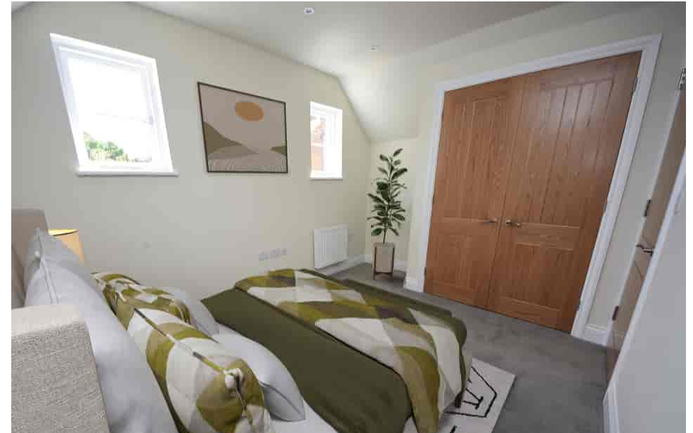
3 The Old Elephant & Castle, Causeway, Banbury, Oxfordshire. OX16 4SN From £237,500 - Freehold