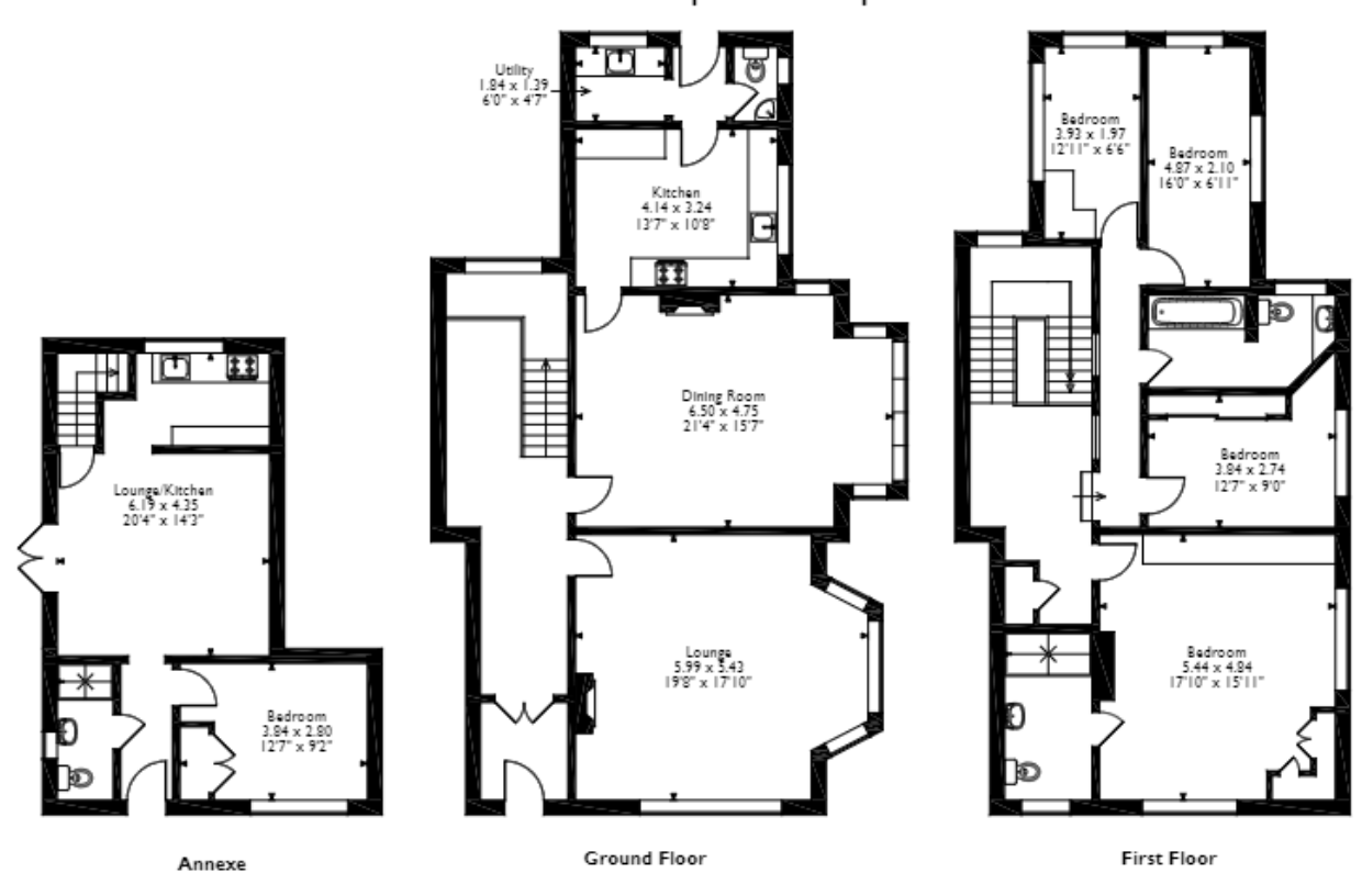
Please note that the location of doors, windows and other items are approximate and this floorplan is to be used for illustrative purposes only. Unauthorized reproduction is prohibited.

Grange View, HealeyRoad, Ossett Approximate Gross Internal Area Main House = 201 Sq M/2163 Sq Ft Annexe = 45 Sq M/484 Sq Ft Total = 246 Sq M/2647 Sq Ft