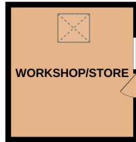
1ST FLOOR 974 sq.ft. (90.5 sq.m.) approx.