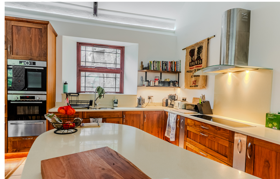
Shaw Lane, Milford, BELPER, Derbyshire DE56 0RE £475,000 - Freehold (to be confirmed)