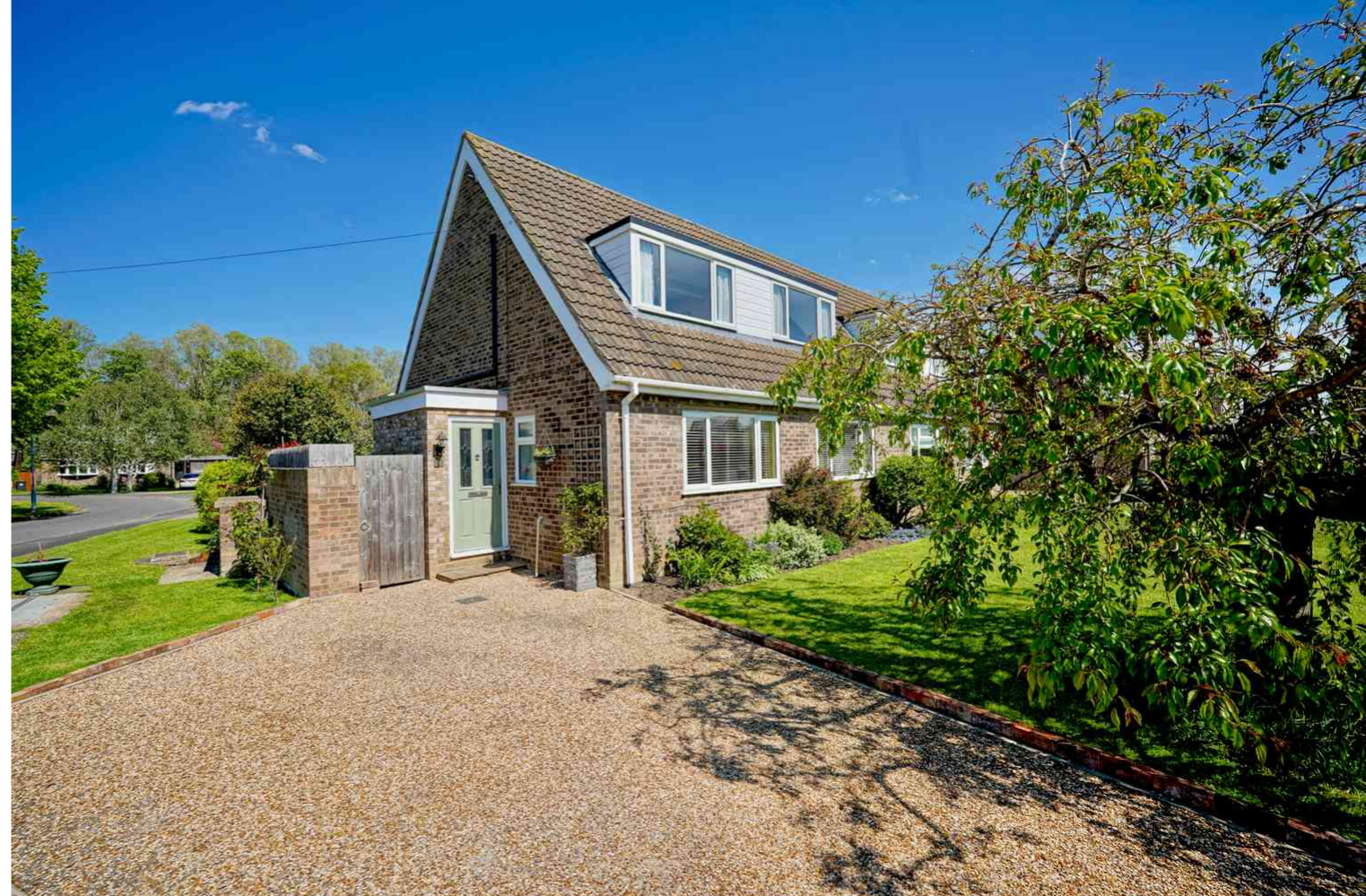
Greenway, Buckden PE19 5TU