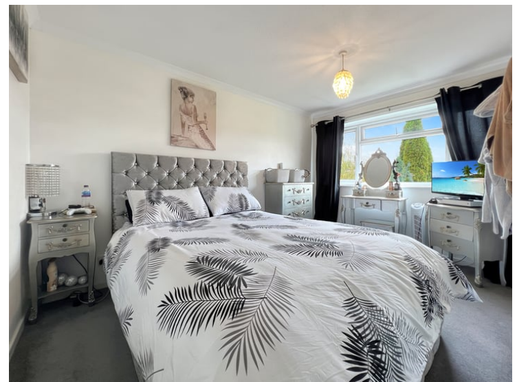
13' 6" x 8' 6" (4.11m x 2.59m)