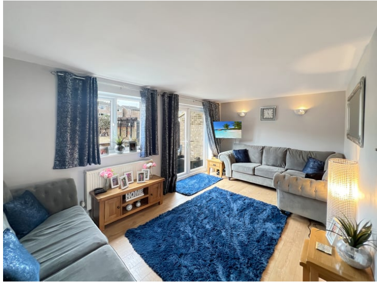
17' 10" x 10' 5" (5.44m x 3.17m)