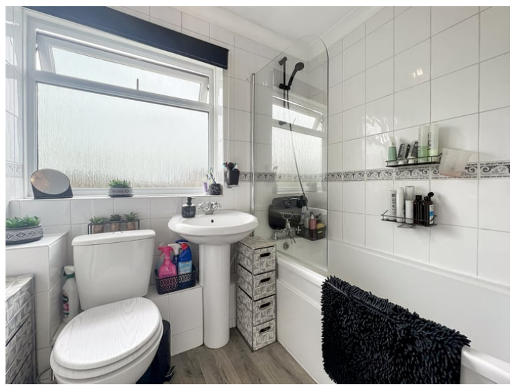
6'11" x 6' 2" (2.11m x 1.88m)