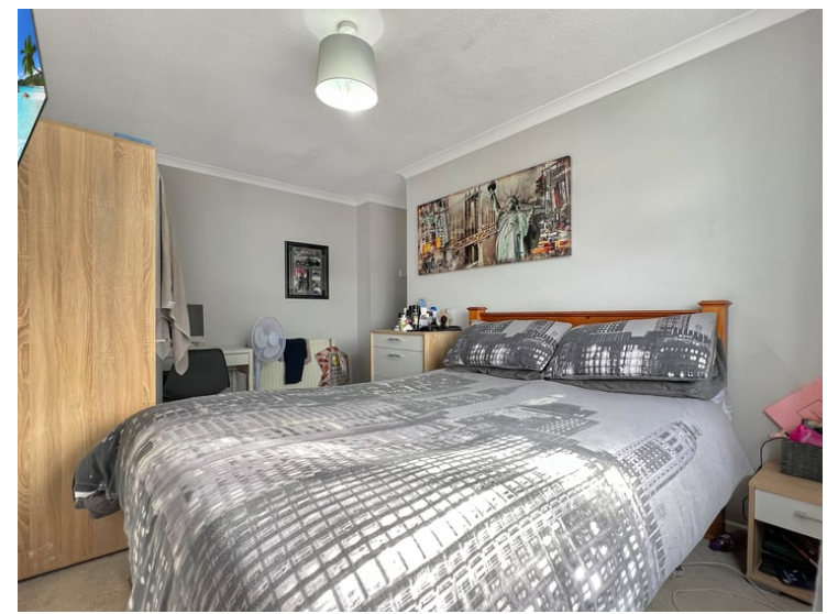
14' 2" x 11' 3" (4.32m x 3.43m)