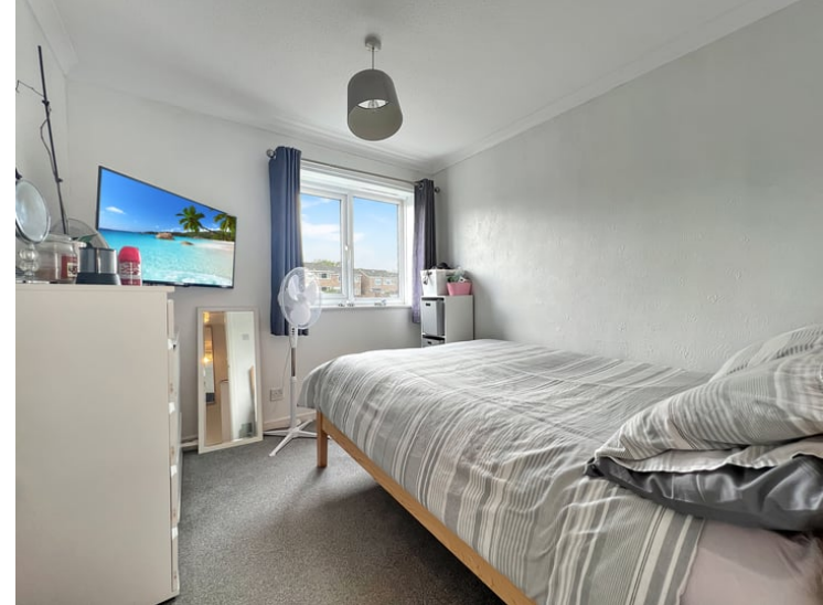
10' 1" x 8' 8" (3.07m x 2.64m)