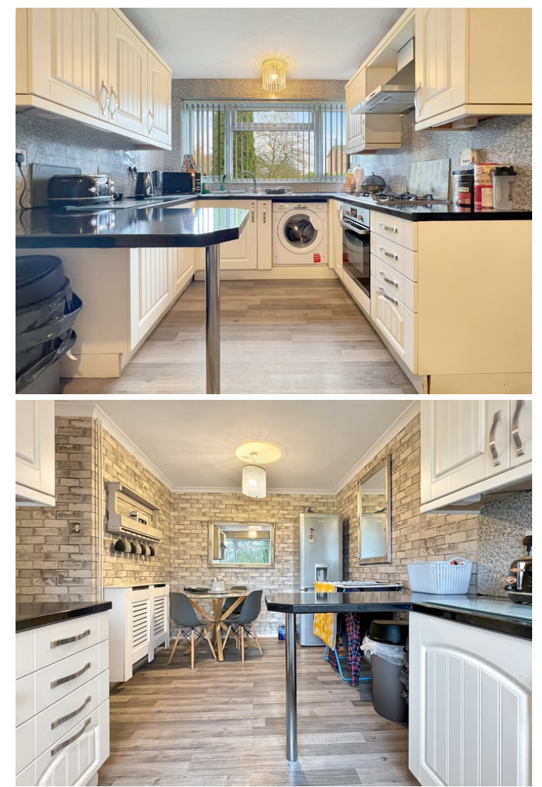
16' 4" x 11' 5" (4.98m x 3.48m)