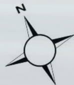
Illustration for identification purposes only; measurements are approximate, not to scale. FP USketch Plan produced using PlanUp.