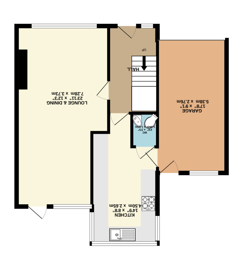
GROUND FLOOR 648 sq.ft. (60.2 sq.m.) approx.