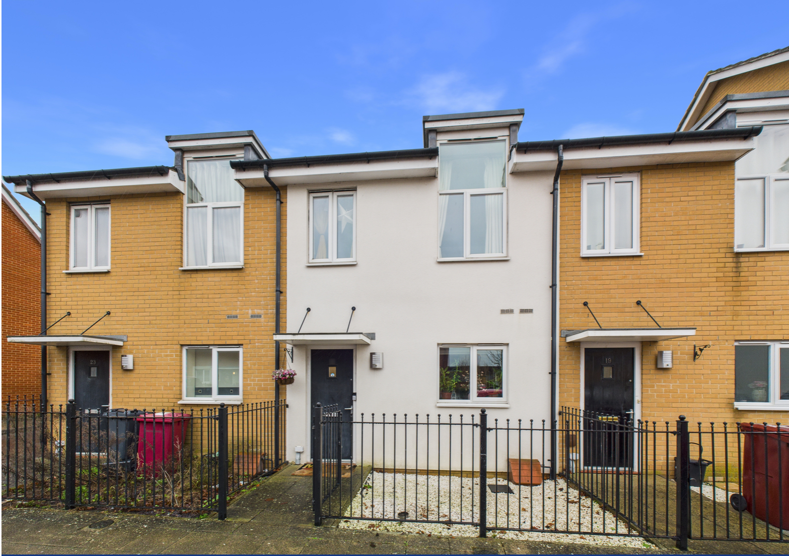
21 Longships Way, Reading. RG2 0FZ.