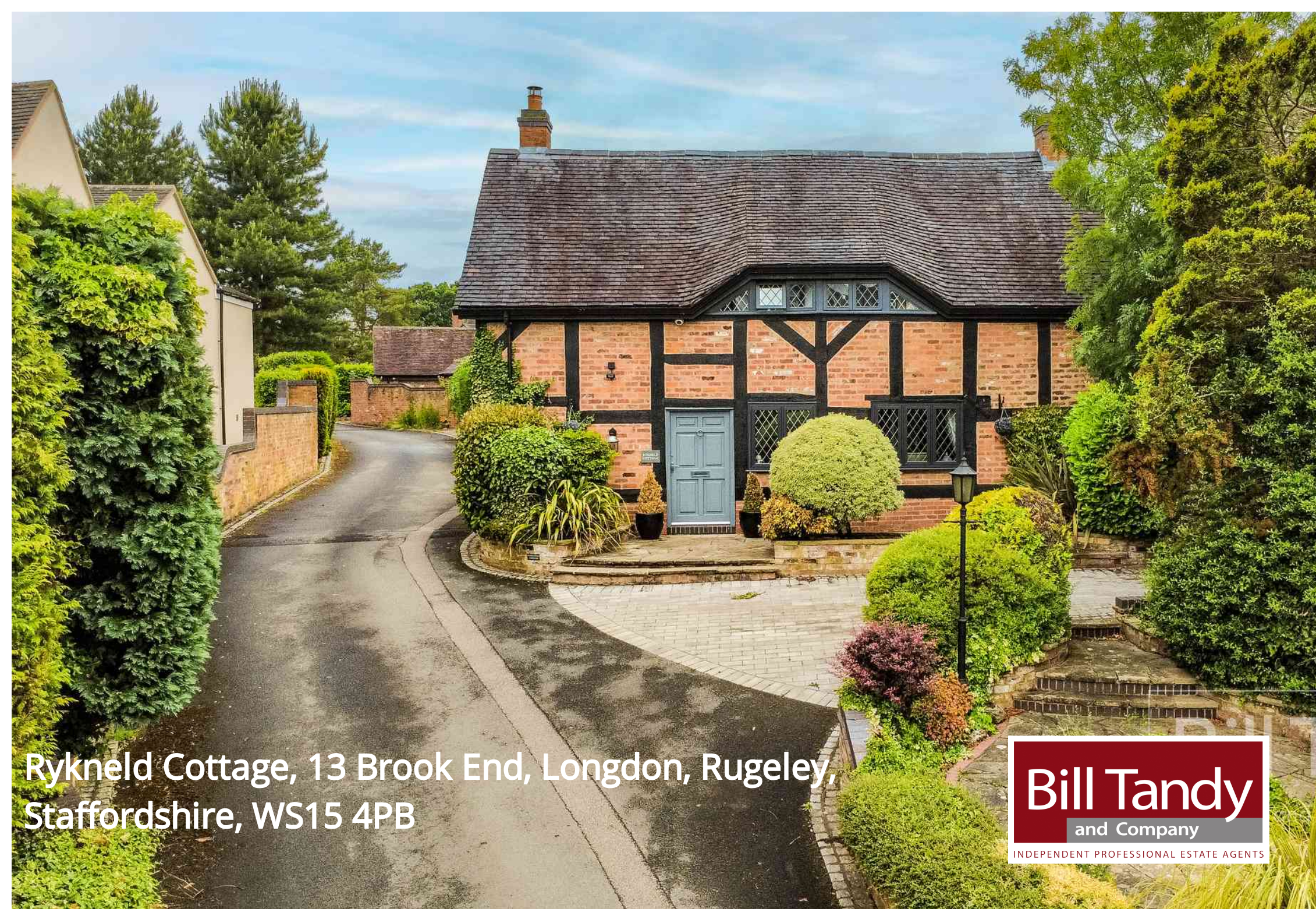
Rykneld Cottage, 13 Brook End, Longdon, Rugeley, Staffordshire, WS15 4PB