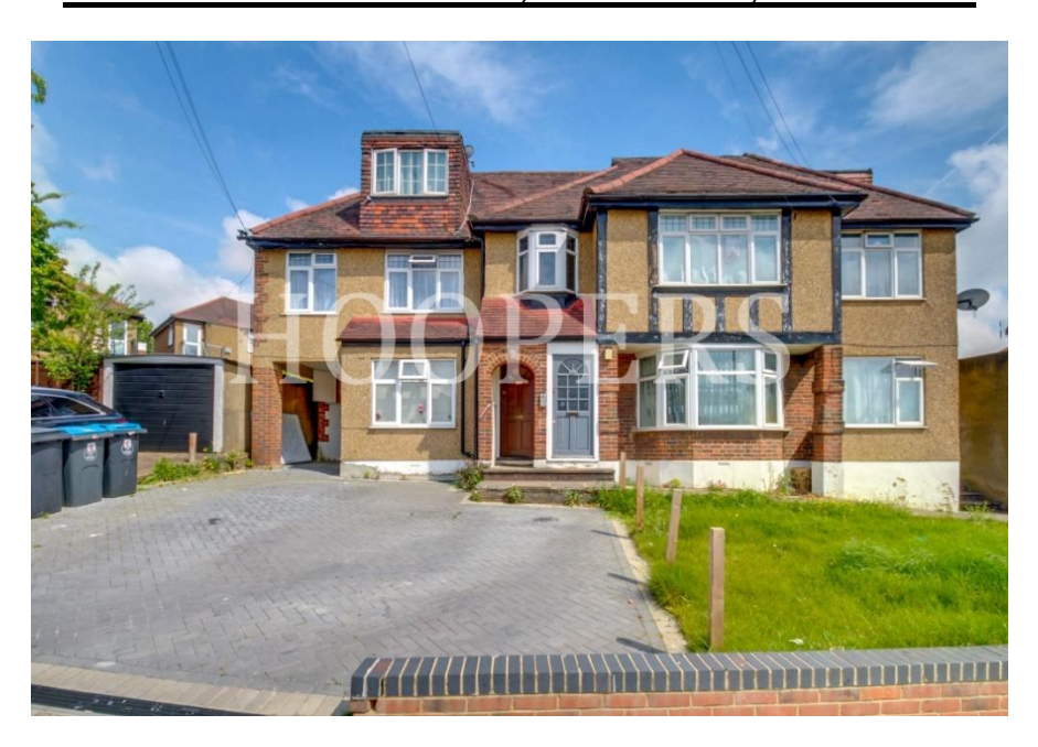
EPC Rating: D

We are delighted to be able to offer for sale this first floor flat converted from a double fronted detached house offering spacious first time buyer accommodation with potential to further develop the property (if required). Benefits include:-