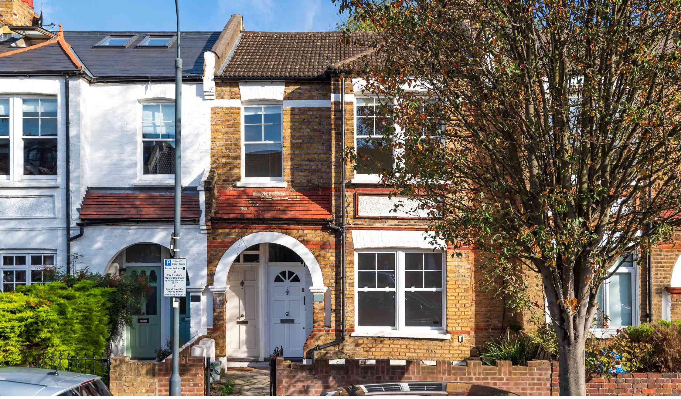
Aylmer Road, London, W12 9LQ