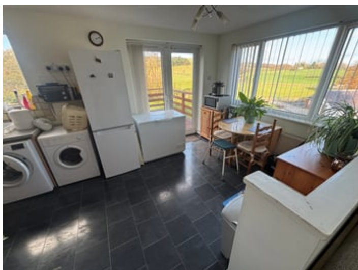
KITCHEN/DINER (THIRD IMAGE)