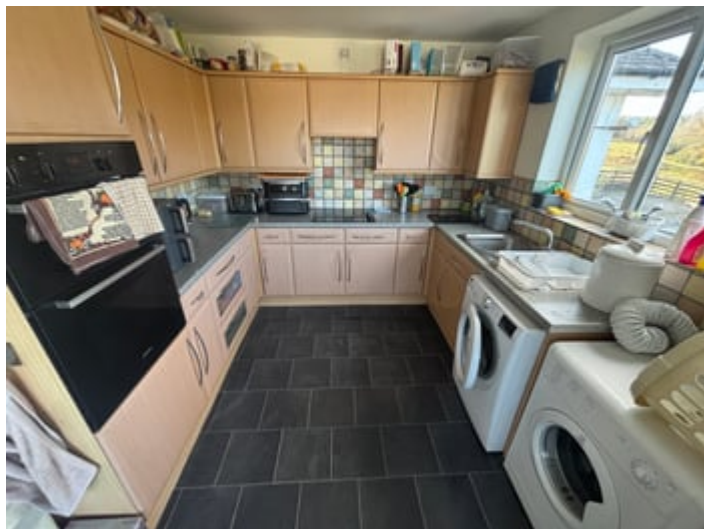
KITCHEN/DINER (SECOND IMAGE)

ceramic hob, space for dishwasher and fridge, French doors opening onto a terraced patio area.