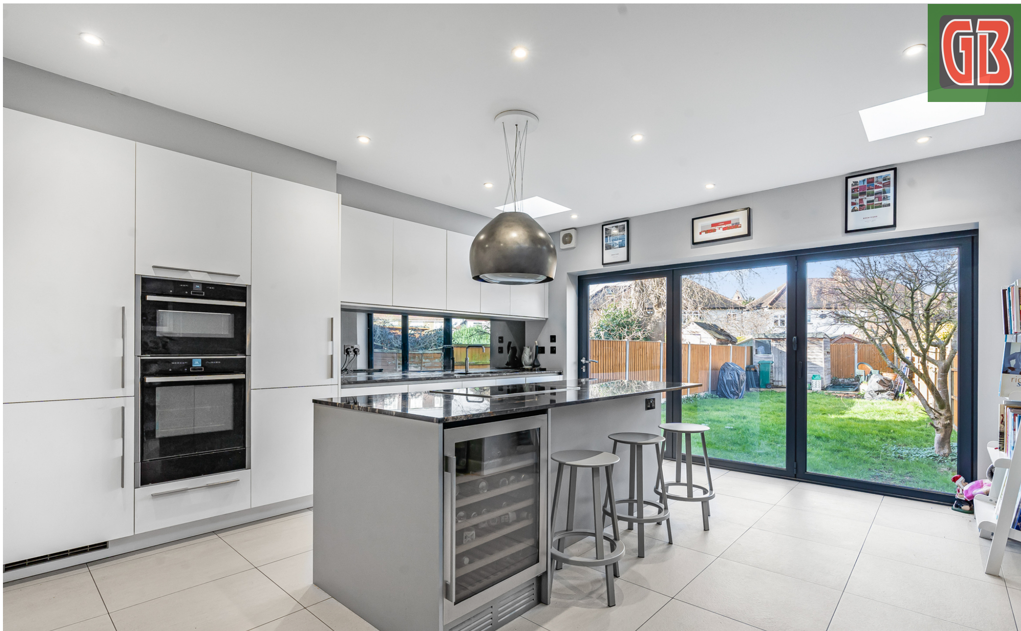
30 Gordon Close, Staines-upon-Thames, Surrey. TW18 1AR. 3 Bedroom Semi-Detached House - £610,000 Freehold