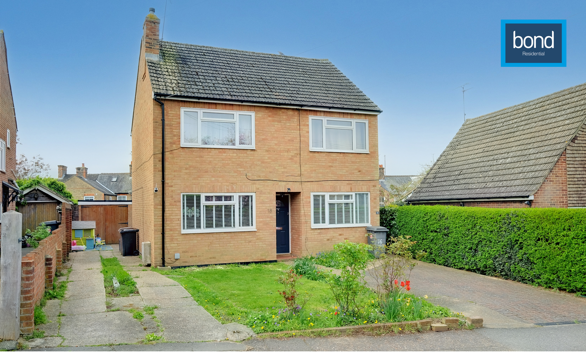
Trinity Road, Chelmsford, Essex, CM2 6HR