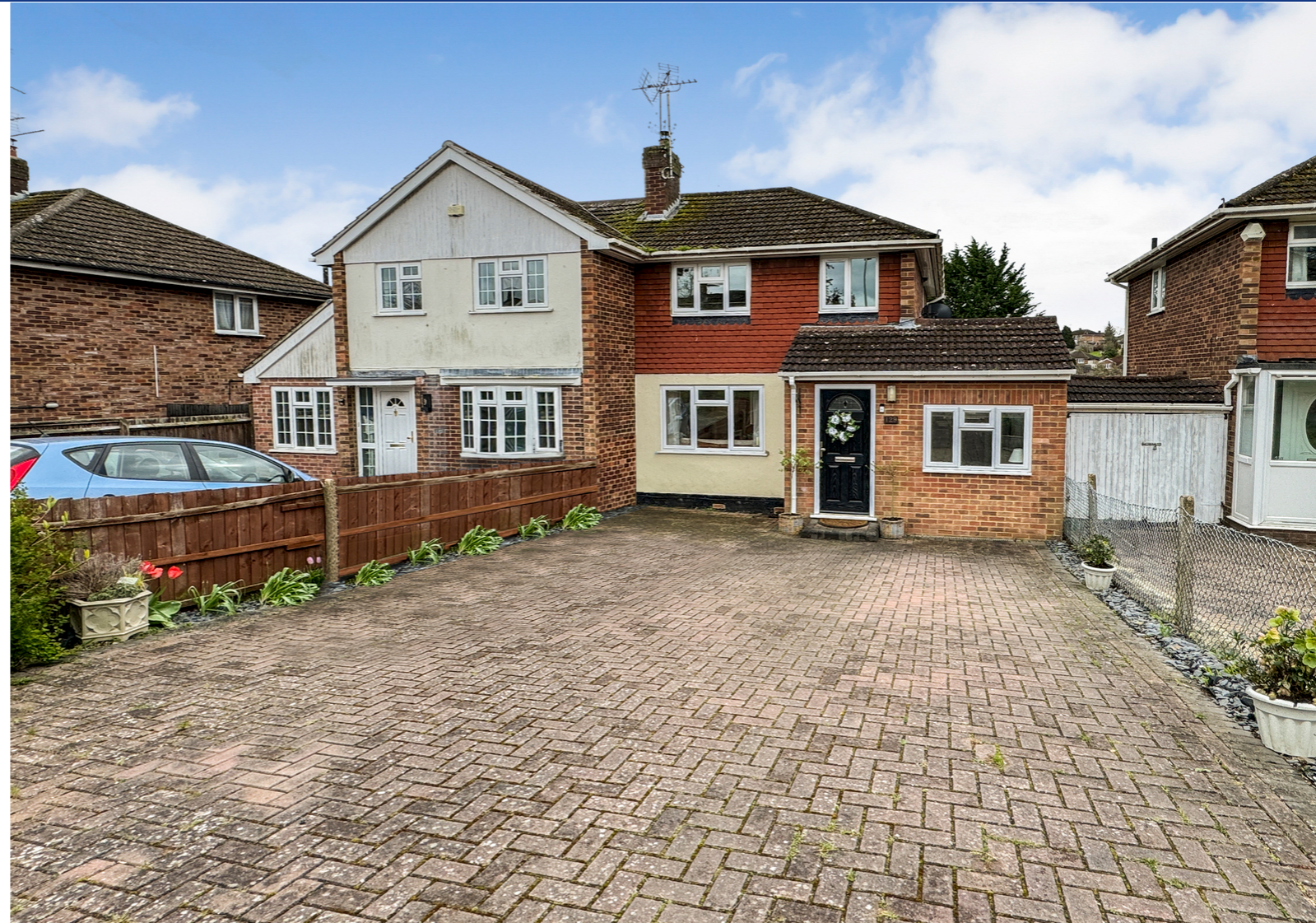
Fairford Road, Tilehurst, Reading.