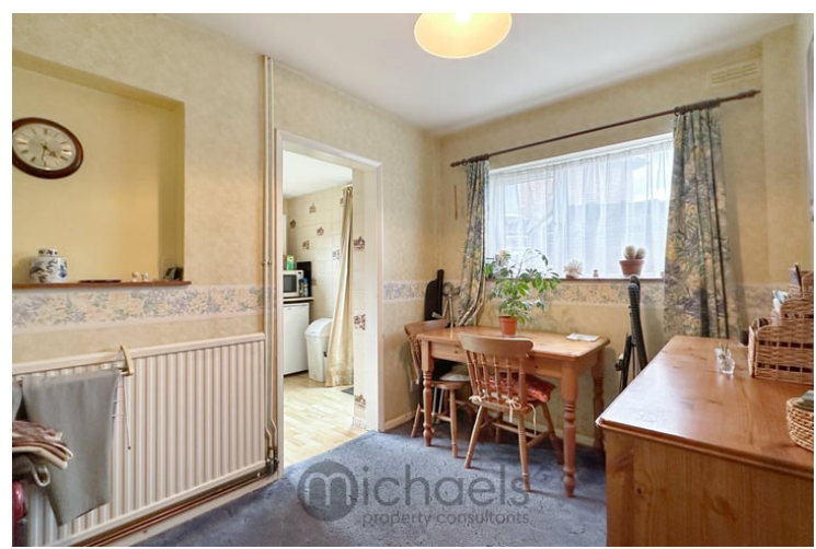
10' 2" x 7' 4" (3.10m x 2.24m) Window to side aspect, radiator