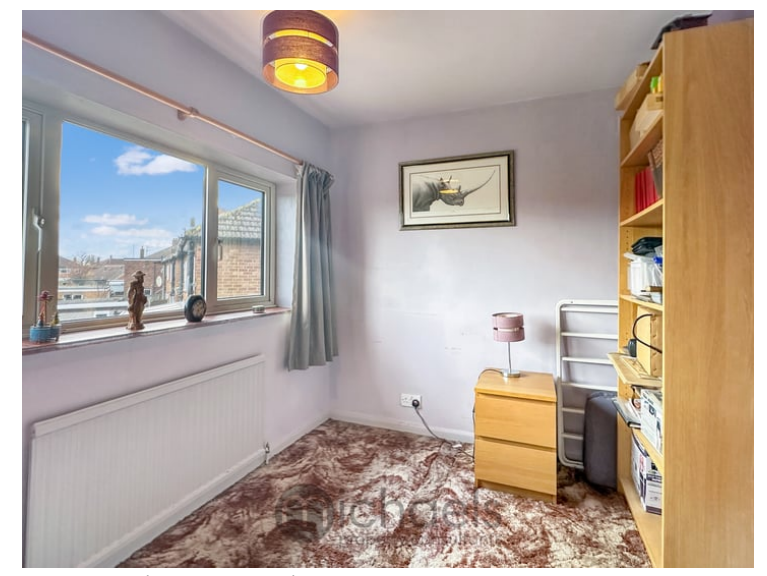
10' 1" x 7' 7" (3.07m x 2.31m) Window to rear aspect, radiator, inset cupboard