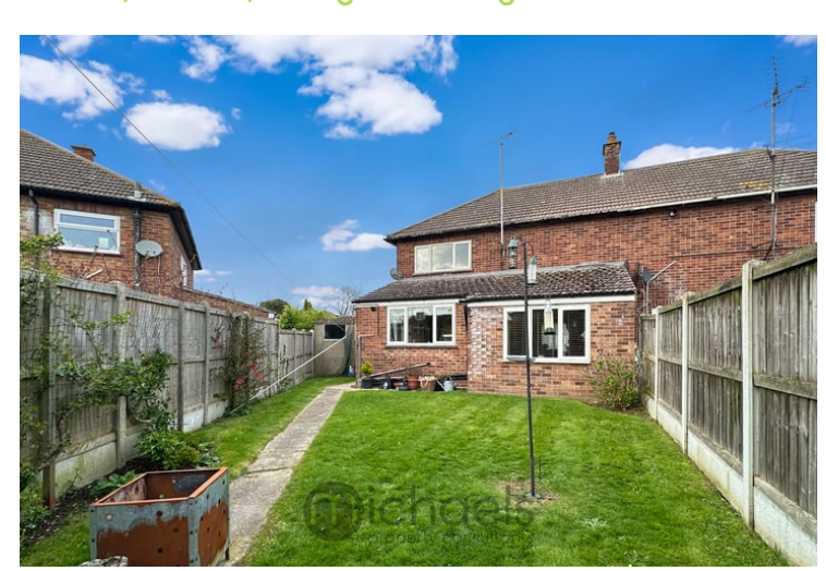
This property benefits from a private and enclosed rear garden, predominately laid to lawn and enclosed by panel fencing. In addition, there is the added luxury of a detached garage and parking is available in front for one vehicle, with further parking accessible on road.