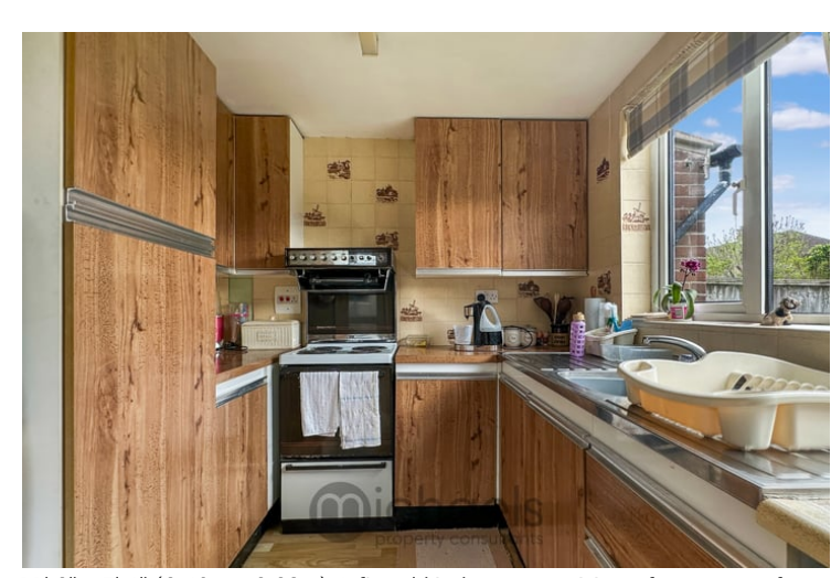
11' 2" x 7' 6" (3.40m x 2.29m) A fitted kitchen comprising of; a range of fitted base and eye level units with work surfaces over, inset sink with taps over, larder cupboard, space for appliances and cooker, wall mounted boiler, window to rear aspect, door to side aspect, radiator