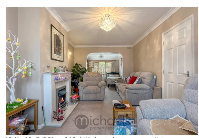
18' 1" x 10' 4" (5.51m x 3.15m) Window to front aspect, radiator, communication points, feature fireplace, open plan to: