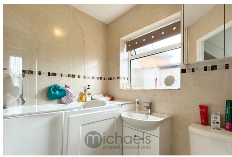
Currently changed for accessible reasons.

Family bathroom suite comprising of; a walk in bath/shower, W.C, wash hand basin, radiator, window to side aspect