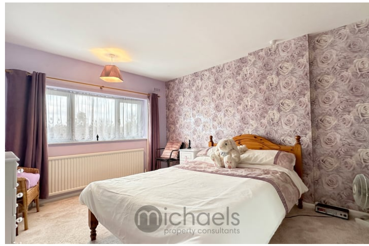
10^{\circ} 6" x 13^{\circ} 3" (3.20m x 4.04m) Window to front aspect, inset wardrobes, radiator

(Please note within the wardrobes resides the hot water cylinder)