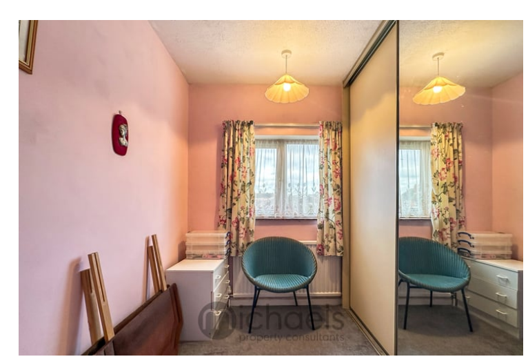
9' 0" x 7' 2" (2.74m x 2.18m) Window to front aspect, radiator, fitted wardrobe