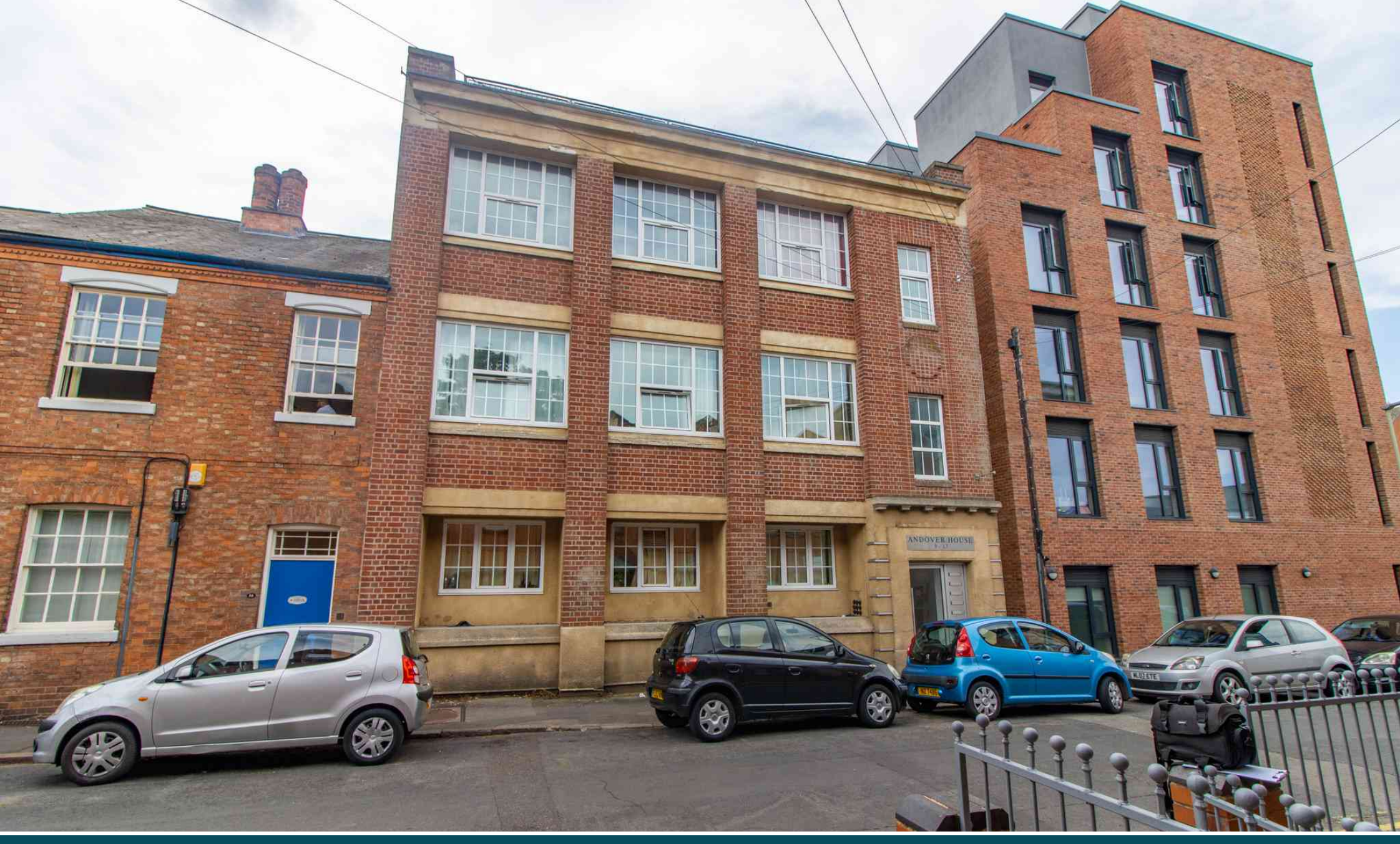
Flat 3, 9-13 Andover Street, LeicesterLE20JA