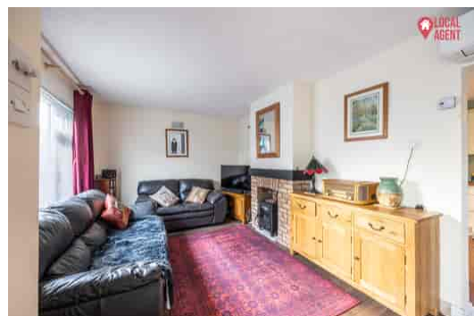
2 Russell Place, Sutton At Hone, Dartford, Kent, DA4 9EB £500,000 Freehold