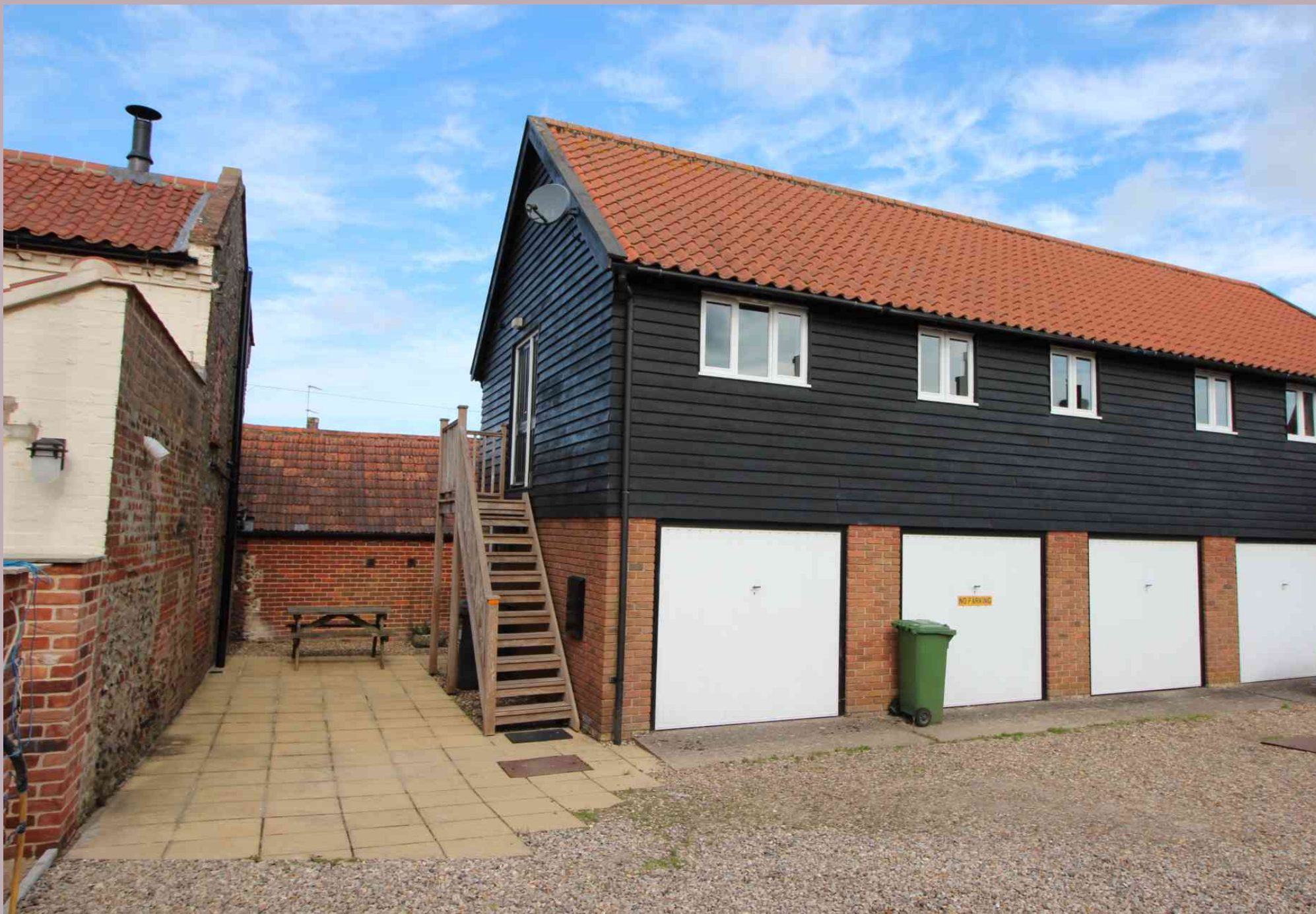
5 Cadamy's Yard Church Street, Wells-Next-The-Sea £925 per calendar month