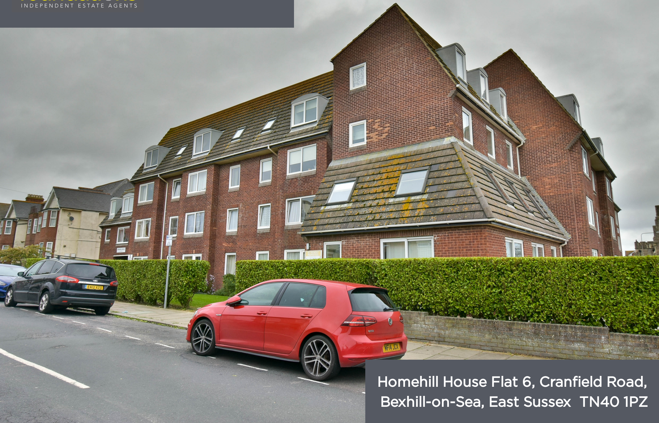
Homehill House Flat 6, Cranfield Road, Bexhill-on-Sea, East Sussex TN40 1PZ