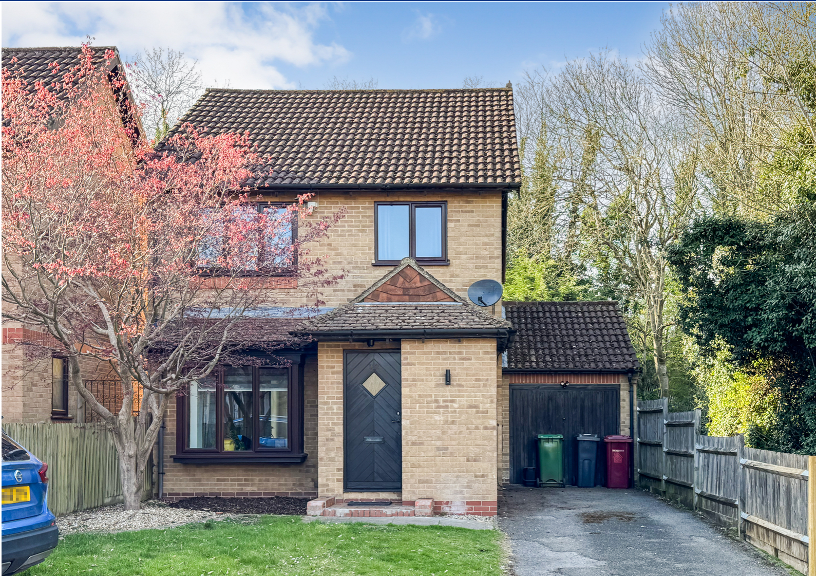
Hirstwood, Tilehurst, Reading, Berkshire.