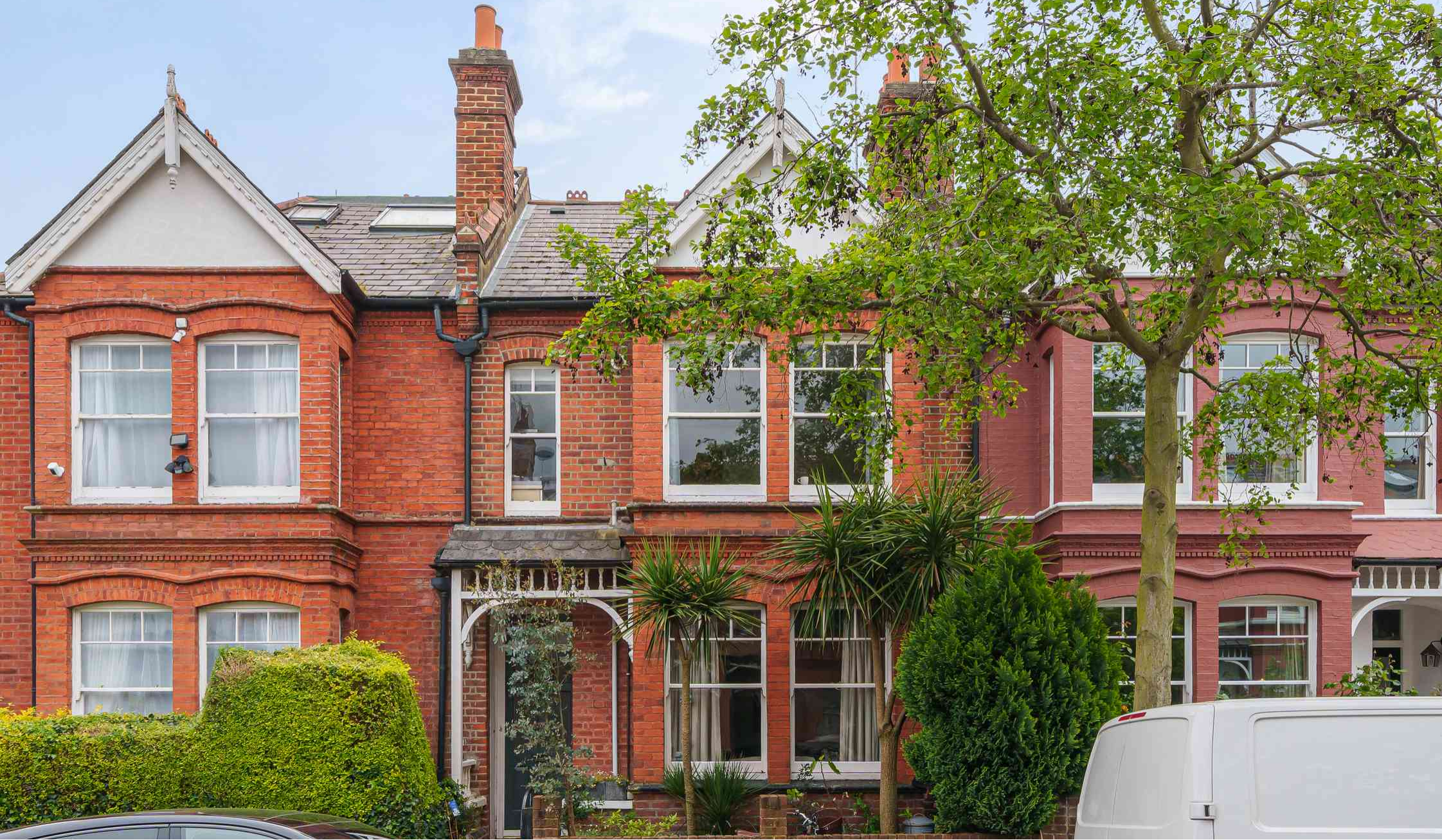
Compton Crescent, London, W4 3JA