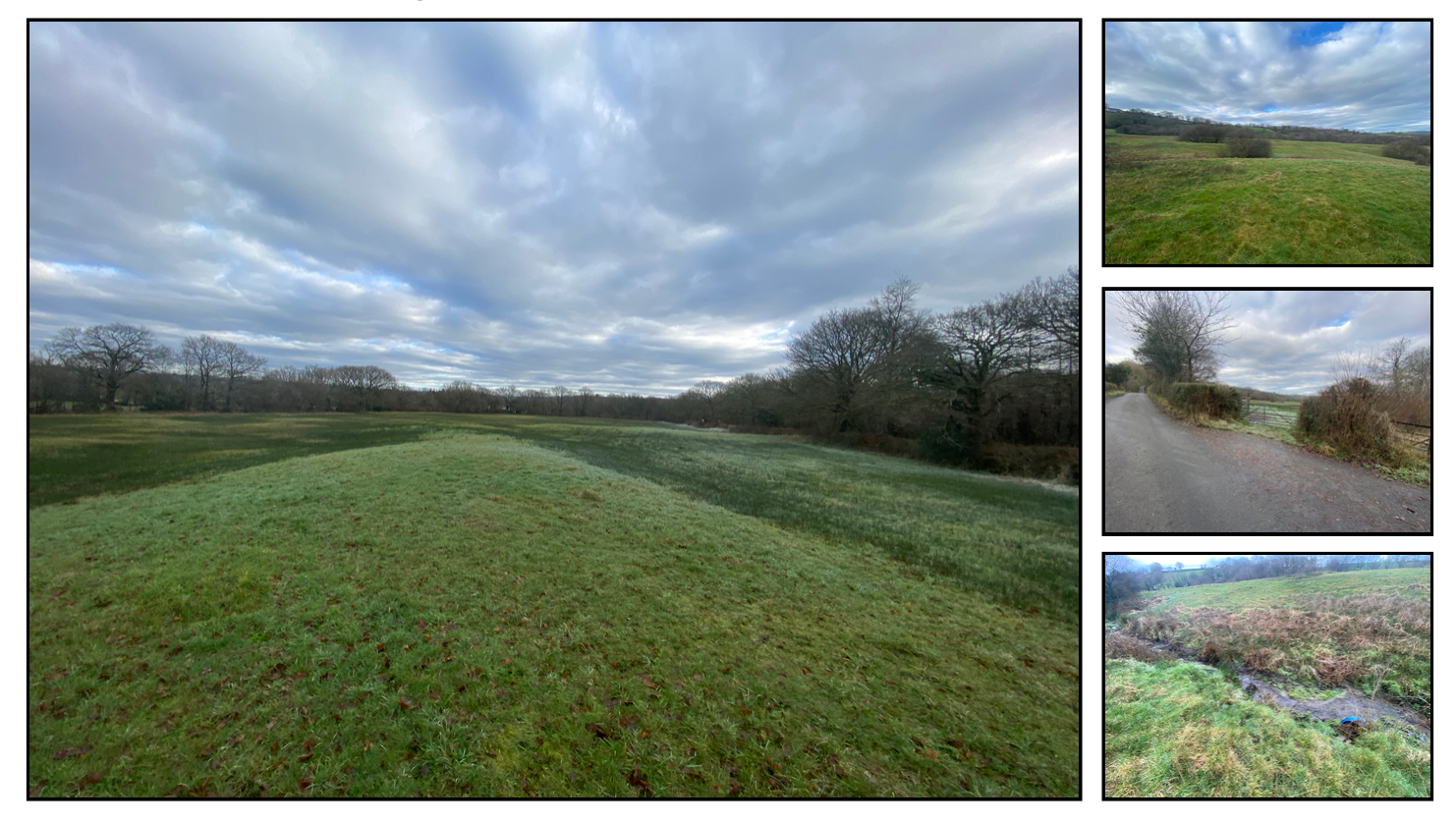
A well situated parcel of 31.889 acres of agricultural and conservation land, close to village of Waungilwen in the heart of the Teifi Valley, West Wales

Estate Agents | Property Advisers Local knowledge, National coverage