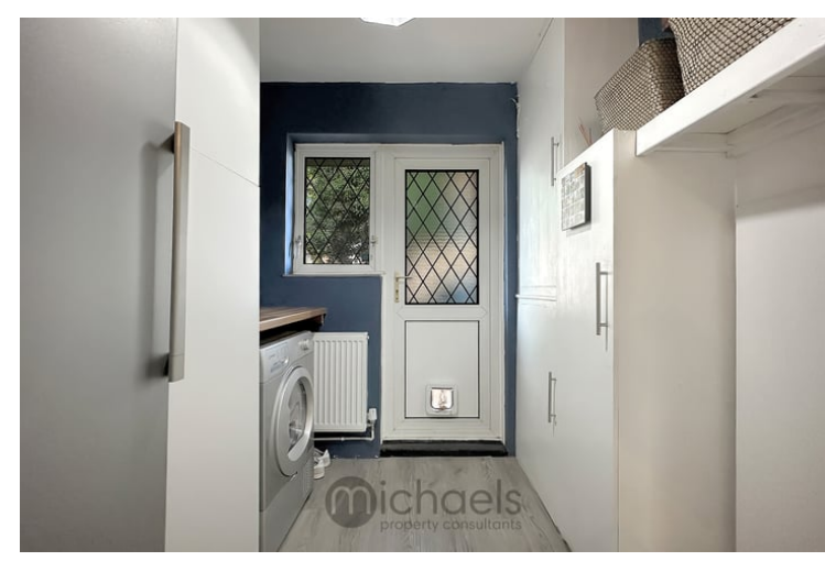
7' 9" x 7' 0" (2.36m x 2.13m)