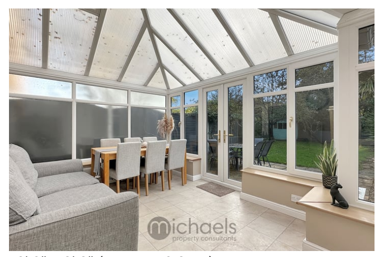
13' 8" x 9' 9" (4.17m x 2.97m)