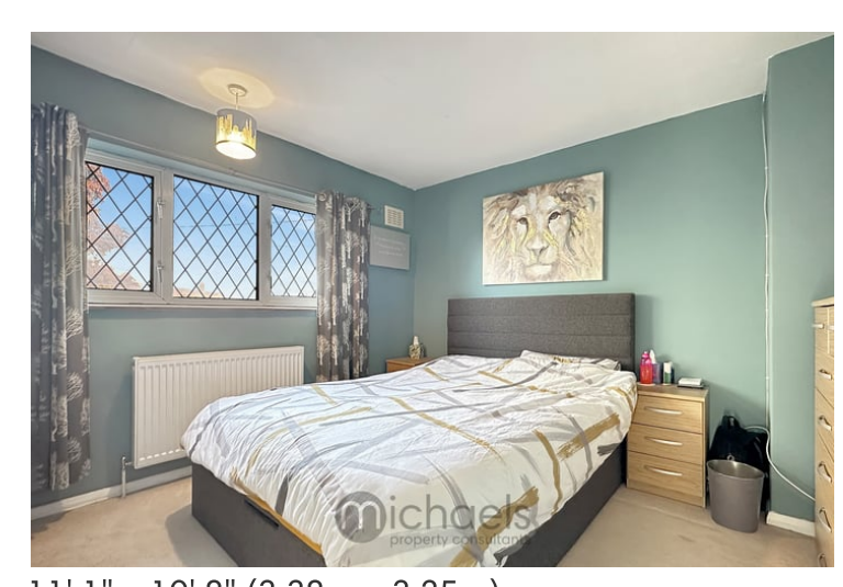
11' 1" x 10' 8" (3.38m x 3.25m)