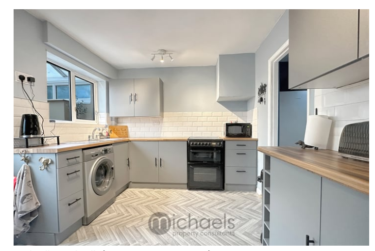
10' 4" x 9' 4" (3.15m x 2.84m)