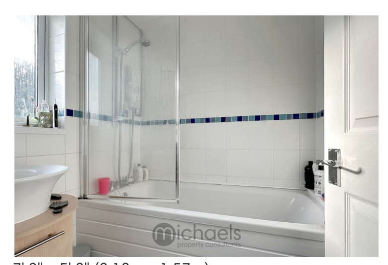
7' 0" x 5' 2" (2.13m x 1.57m)