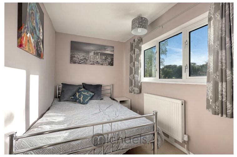
11'0" x 6'6" (3.35m x 1.98m)