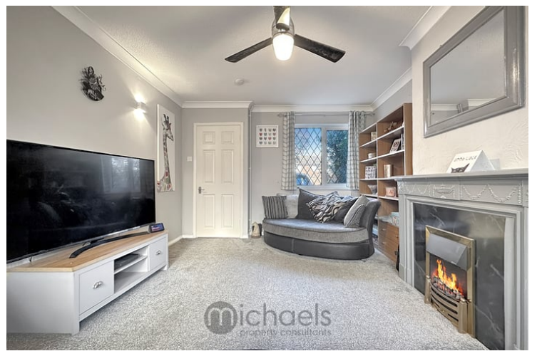
16' 8" x 11' 1" (5.08m x 3.38m)