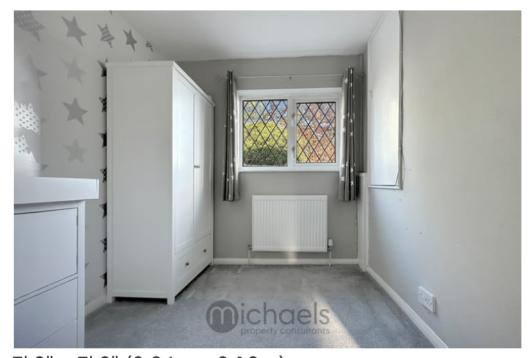
7' 8" x 7' 2" (2.34m x 2.18m)