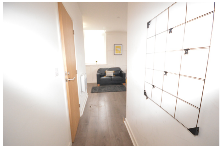
Private entrance door leaving into: