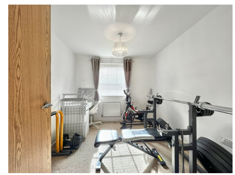
10' 5" x 8' 5" (3.17m x 2.57m)