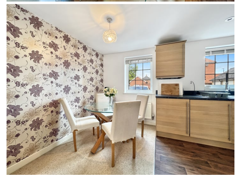
22' 2" x 13' 8" MAX (6.76m x 4.17m)