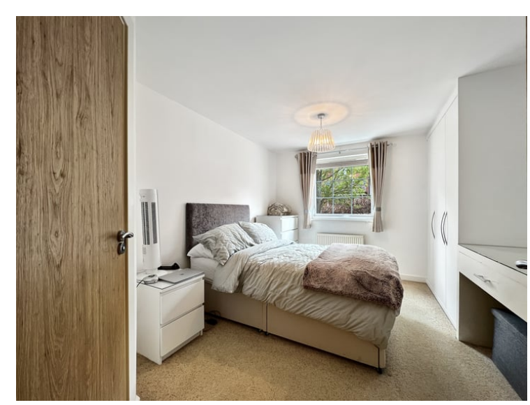
12' 8" x 8' 2" (3.86m x 2.49m)