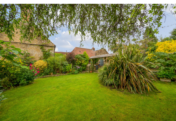
OIRO £650,000 Freehold

A delightful four-bedroom period home with stunning gardens, set in the historic village of Norton St Philip and under ten miles away from the Georgian city of Bath.