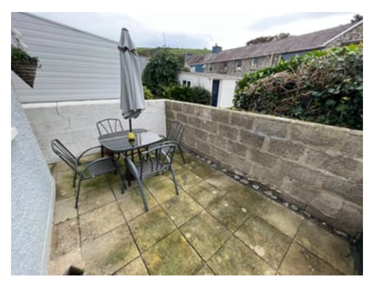
To the Front