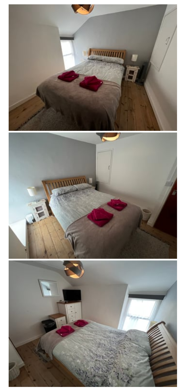
Double Bedroom 2

12' 4" x 9' 5" (3.76m x 2.87m) with double glazed window to front and exposed timber floorboards. Electric panel heater.