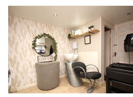
8 Methuen Road, Poole, Dorset BH17 7NA