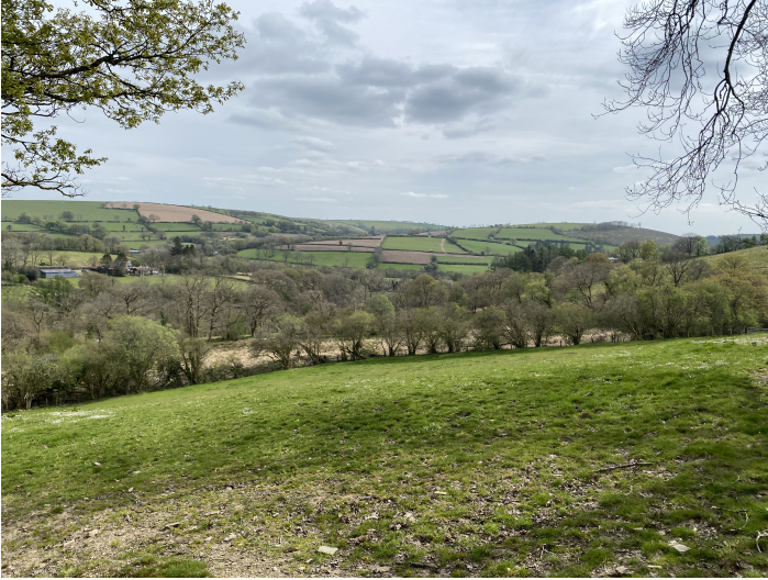
LAND (SECOND IMAGE)

The land is healthy productive pasture including grazing and river meadows, all with internal fencing and traditional hedging providing adequate shelter. The majority has water available and the land encompasses various pockets of deciduous native oak woodland and conservation areas intersected by a stream which would be ideal for creation of ponds or planting for additional woodland including various areas providing rich habitats for wildlife. In all a delightful smallholding extending in total to some 18.2 acres or thereabouts.