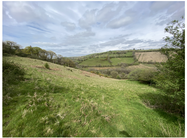
TRACK TO RIVER MEADOW