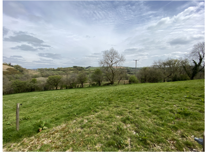
LAND (FOURTH IMAGE)