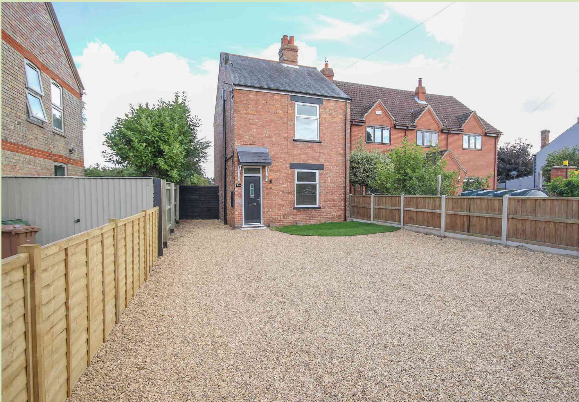
3 St Peters Road, Wiggenhall St Germans Guide Price £250,000