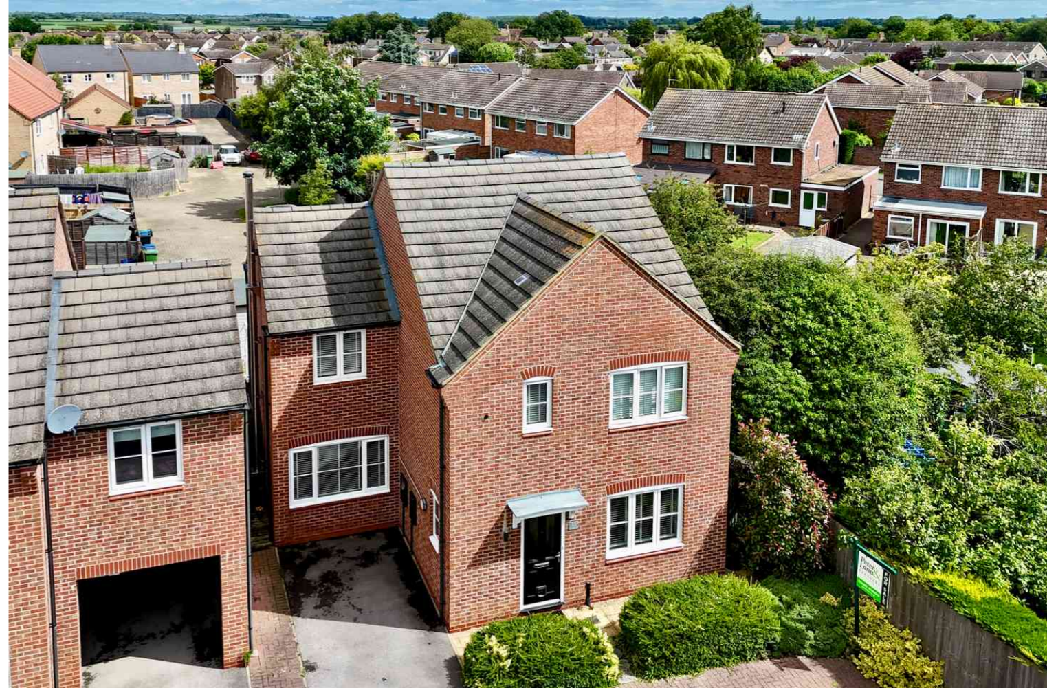
Rowell Way, Sawtry PE28 5WA