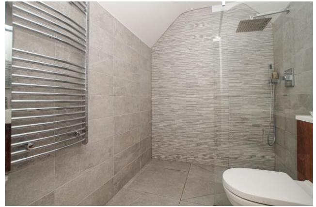
BEDROOM 1 & EN-SUITE

BEDROOM 2 (12'9 x 8'3) Remote control skylight.