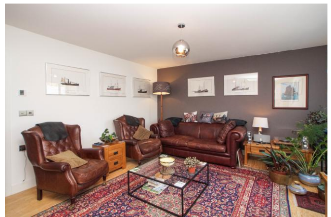
OPEN PLAN DINING LOUNGE/KITCHEN