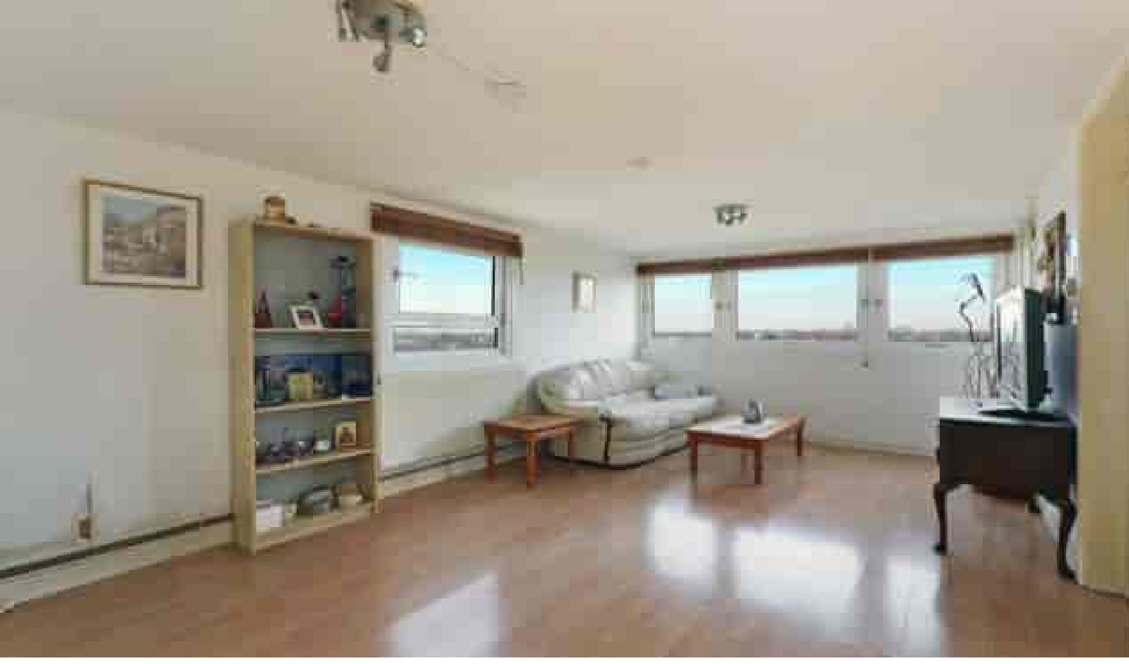
Lexden Road, London, W3 9NG