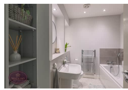
Our Seller says....