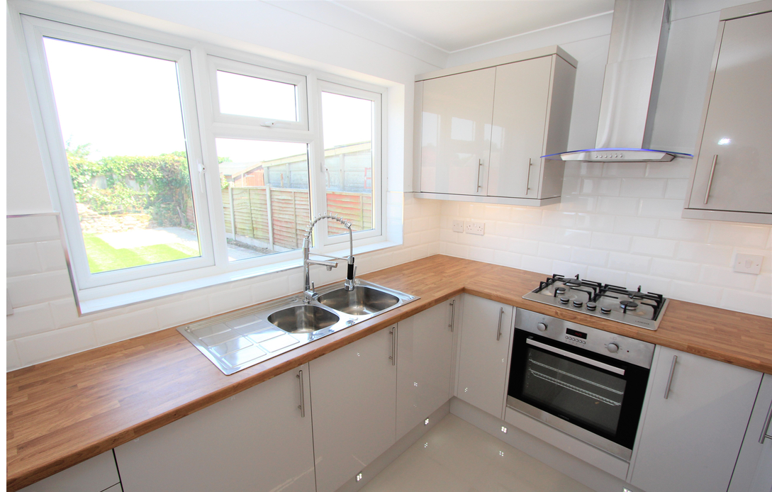
22 Rosary Gardens, Ashford, Surrey TW15 1BX £525,000 - Freehold