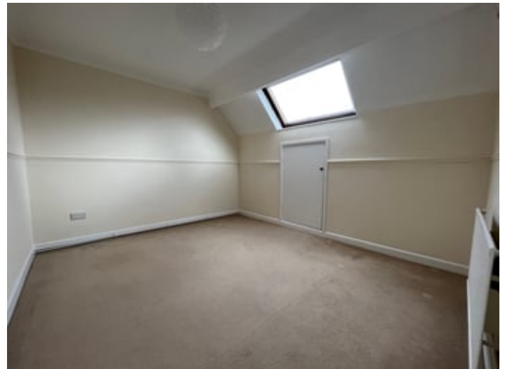
11' 7" x 6' 3" (3.53m x 1.91m) double bedroom, Velux rooflight, radiator, under-eaves storage, multiple sockets.