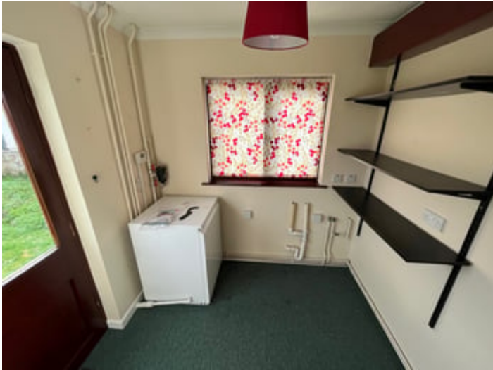
5' 9" x 7' 5" (1.75m x 2.26m) plumbing for washing machine, Grant oil boiler, entrance door to garden, side window, multiple sockets.