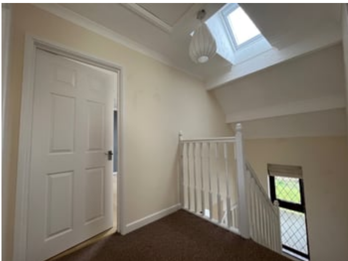
with window to half landing and Velux rooflight over, access to loft, good size airing cupboard and storage space with radiator.