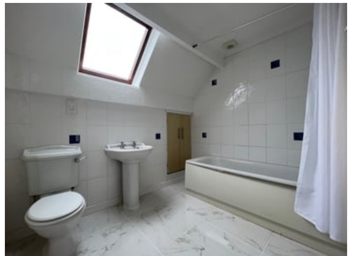
7' 1" x 8' 9" (2.16m x 2.67m) Modern white bathroom suite