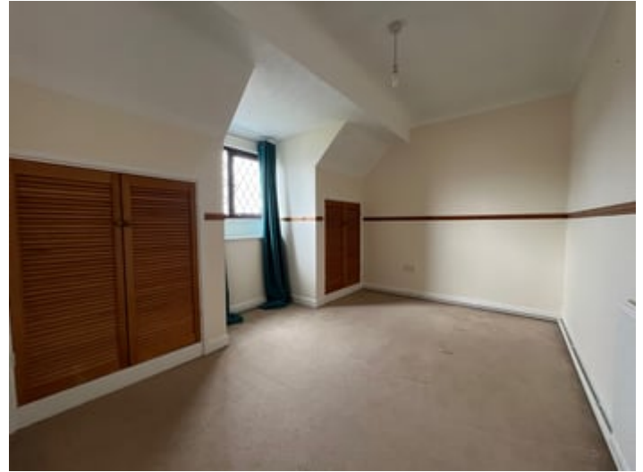
11' 7" x 9' 7" (3.53m x 2.92m) (max) double bedroom, window to front, 2 x fitted cupboards, radiator, 2 x under-eaves cupboards, multiple sockets.