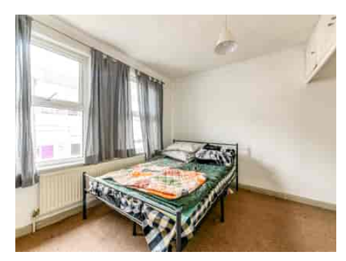
37 Zion Road, Thornton Heath, Surrey, CR7 8RJ