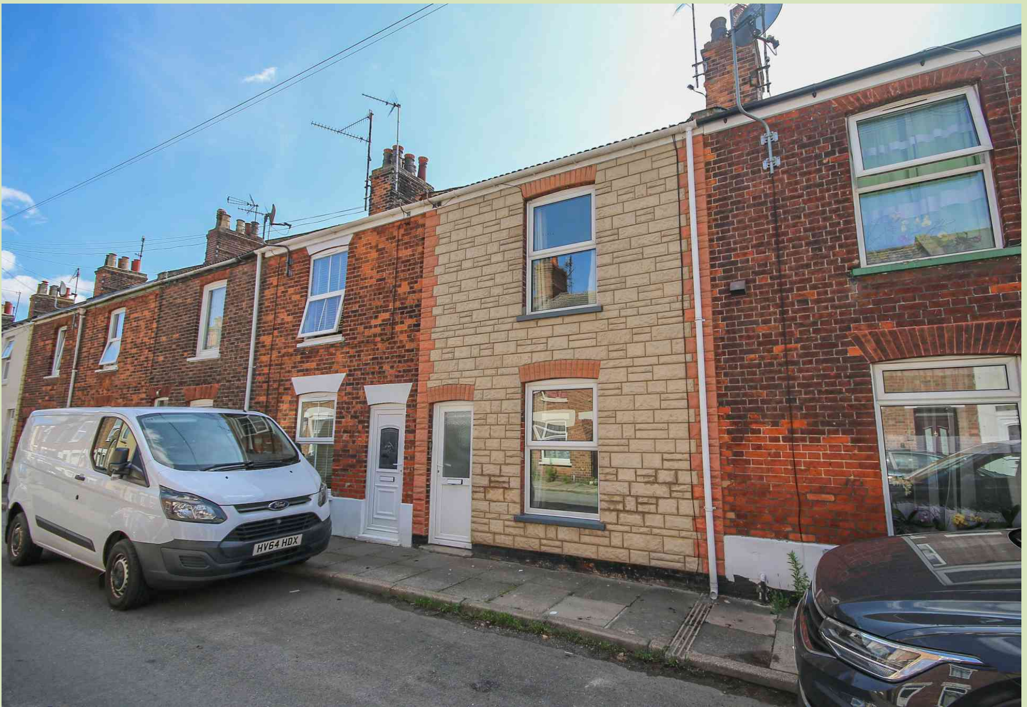
21 Diamond Street, King's Lynn Guide Price £125,000