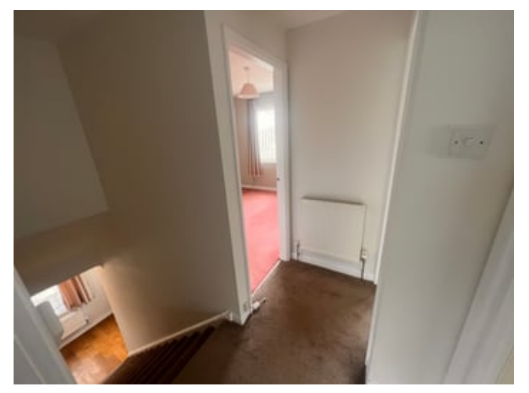
With access to loft, radiator.