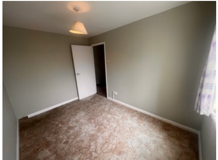
Rear Bedroom 3

9' 3" x 12' 8" (2.82m x 3.86m) Double Bedroom, rear window with views over the Garden, multiple sockets, radiator. Side access door into: