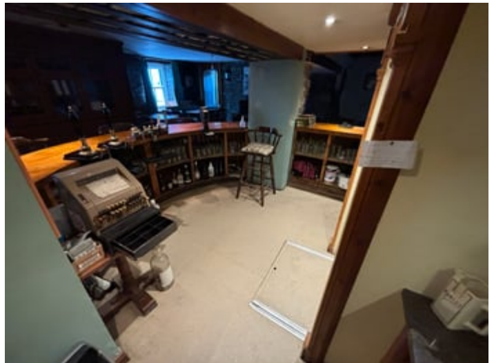
Bar Area Photos