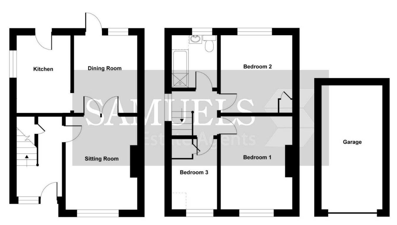
Floor plan for illustration purposes only - not to scale