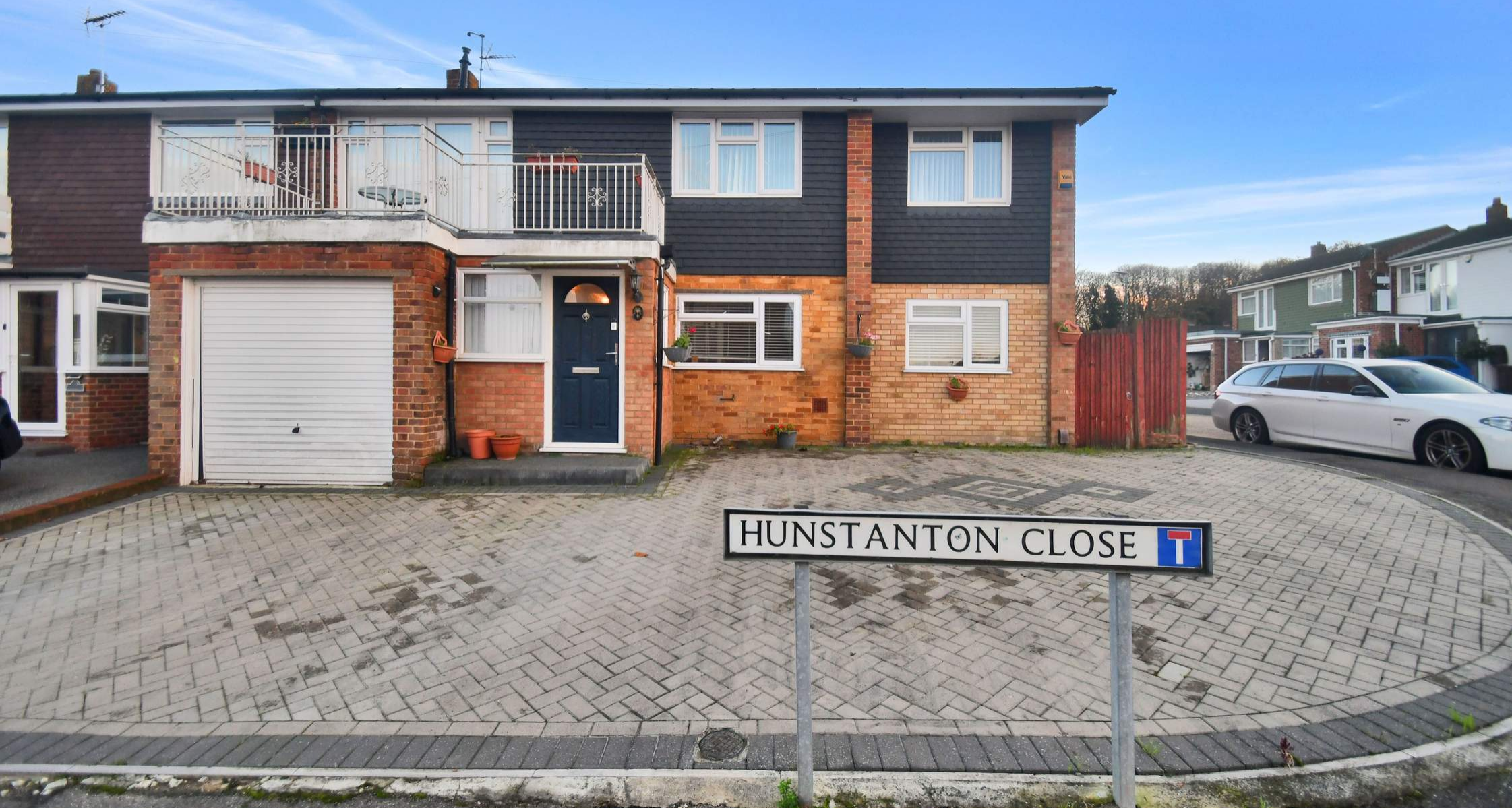
Four Bedroom End of Terrace House Hunstanton Close, Rainham, Gillingham, Kent, ME8 8RL