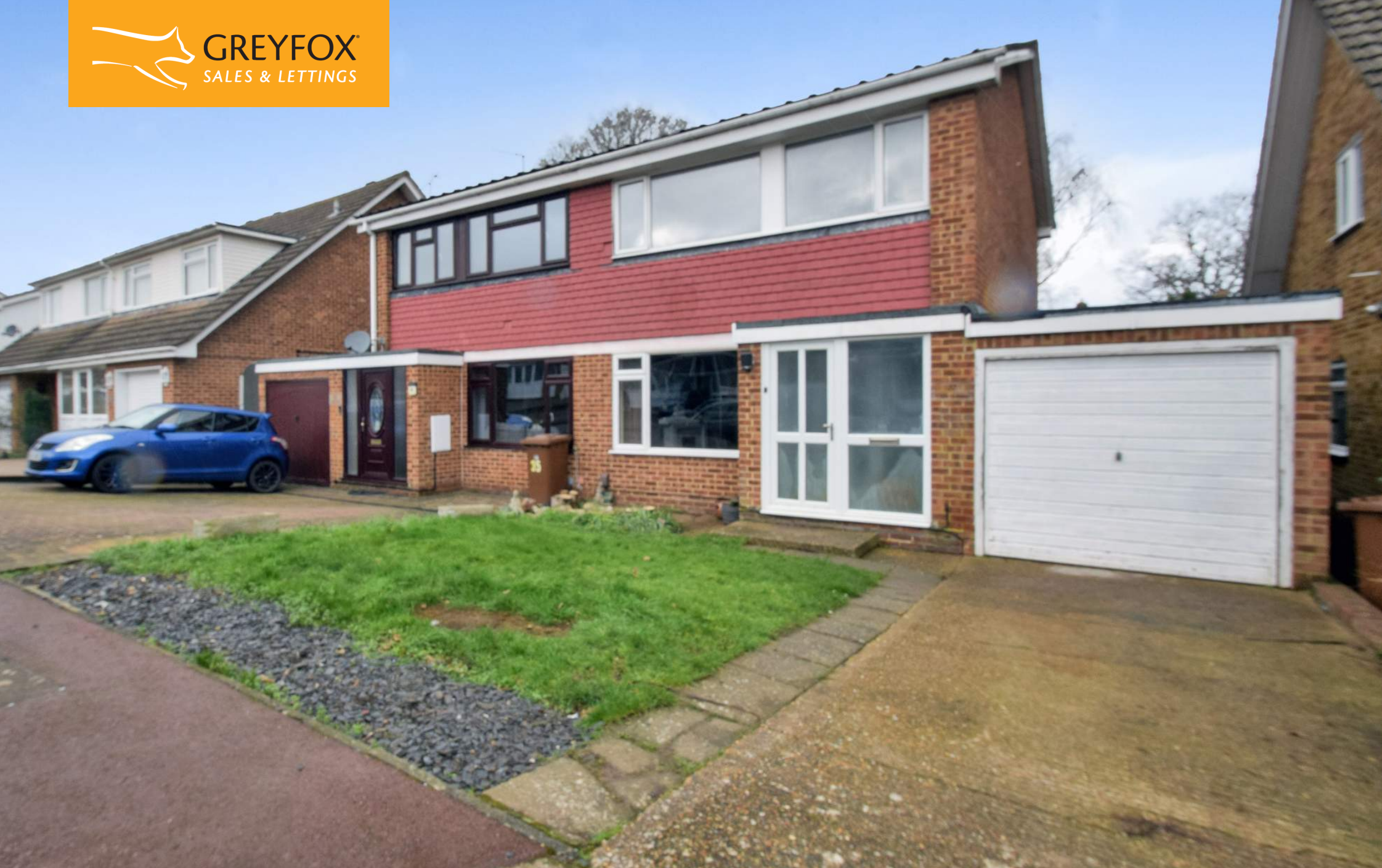
Three Bedroom Semi-Detached House Winchester Avenue, Chatham, Kent, ME5 9AR