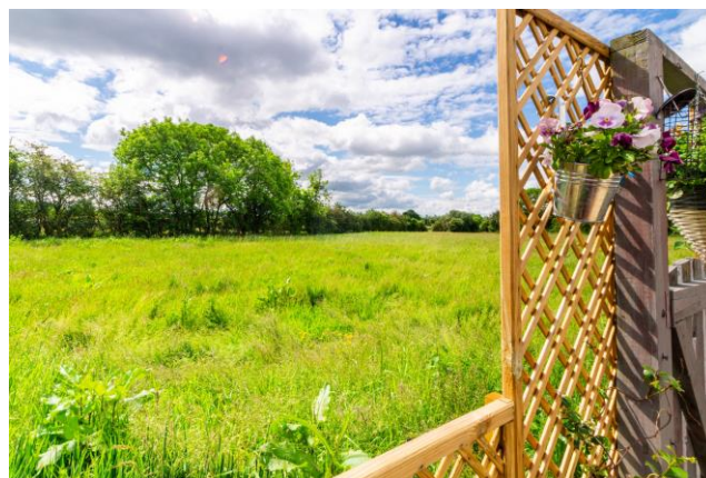
VIEW TO THE REAR

TENURE We are informed the tenure is Freehold.