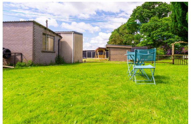
SEPARATE GARDEN AREA