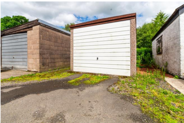
DETACHED SINGLE GARAGE