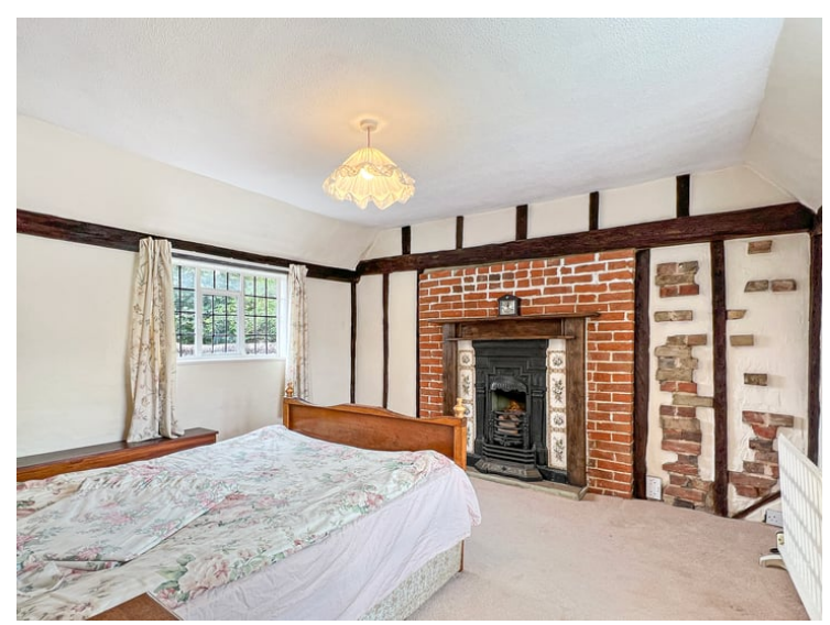
3.73m x 3.58m (12' 3" x 11' 9")